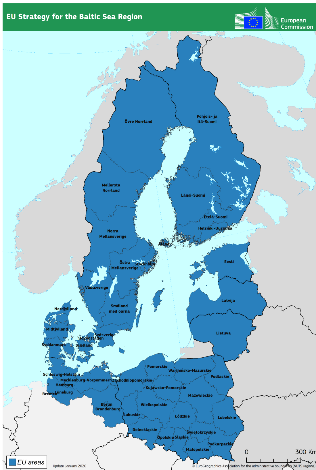
Annex 1: map of the EU Strategy for the Baltic Sea Region