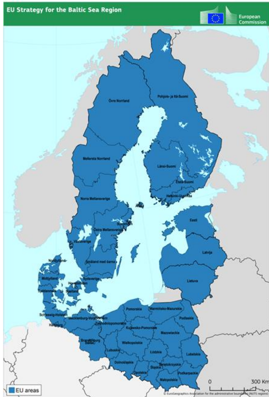
Annex 1: map of the EU Strategy for the Baltic Sea Region