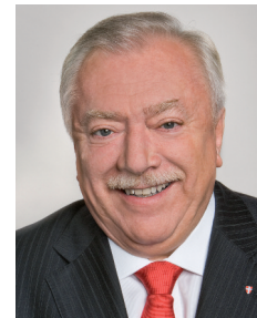
Michael Häupl Mayor and Governor of Vienna