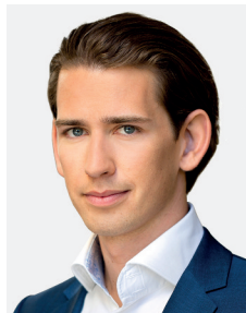
Sebastian Kurz Federal Minister for Europe, Integration and Foreign Affairs, Austria