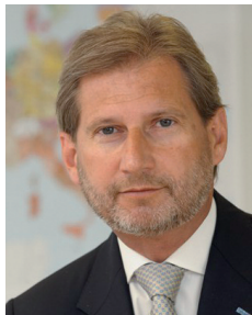
Johannes Hahn Member of the European Commission

The 3 RD ANNUAL FORUM OF THE EUSDR is a big opportunity to meet, discuss and decide the future of the Danube Region. It is about perspectives for our citizens. We look forward to meeting you in Vienna.